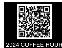
2024 COFFEE HOUR