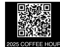
2025 COFFEE HOUR

Men's Choir: Thur. Dec 12th & 19th — practice 7 to 8:30 pm in the Sanctuary Sun. Dec 22nd — sing the Divine Liturgy